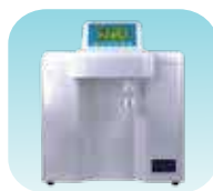
Water purification system