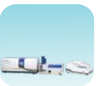
Laser Particle Size Analyzer