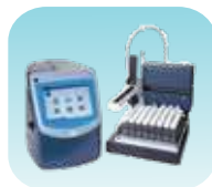
Total Organic Carbon 3800