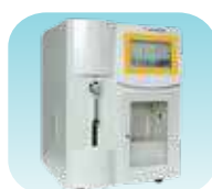
Liquid Partical Counter