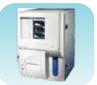
HEMA 2062 Hematology Analyzer