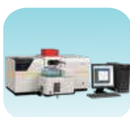
Atomic Absorption Spectrophotometer